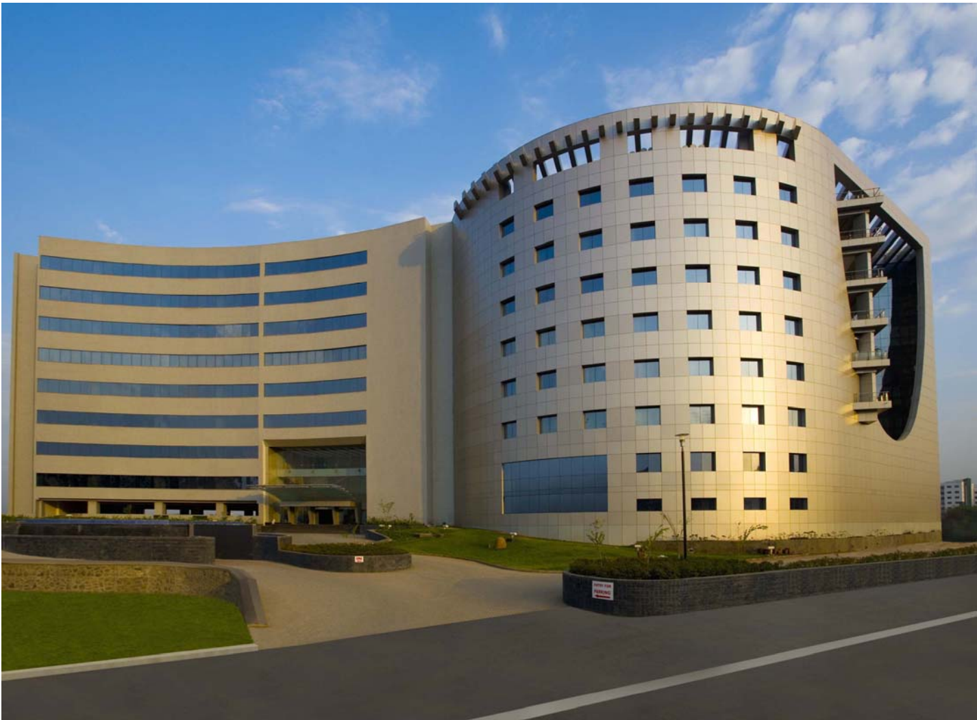
ACTUAL PHOTOGRAPH : Block 'D'